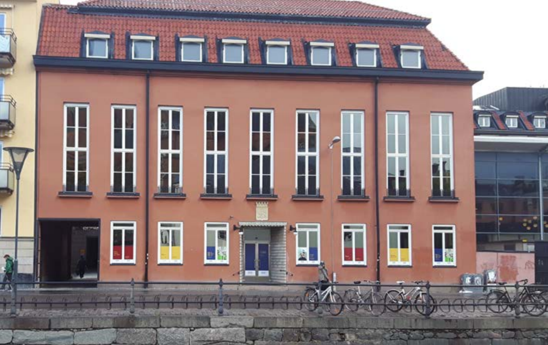
Evening Mingle and Refreshments at 18:00 @ 'the Sustainability Hub', Östra Ågatan 19